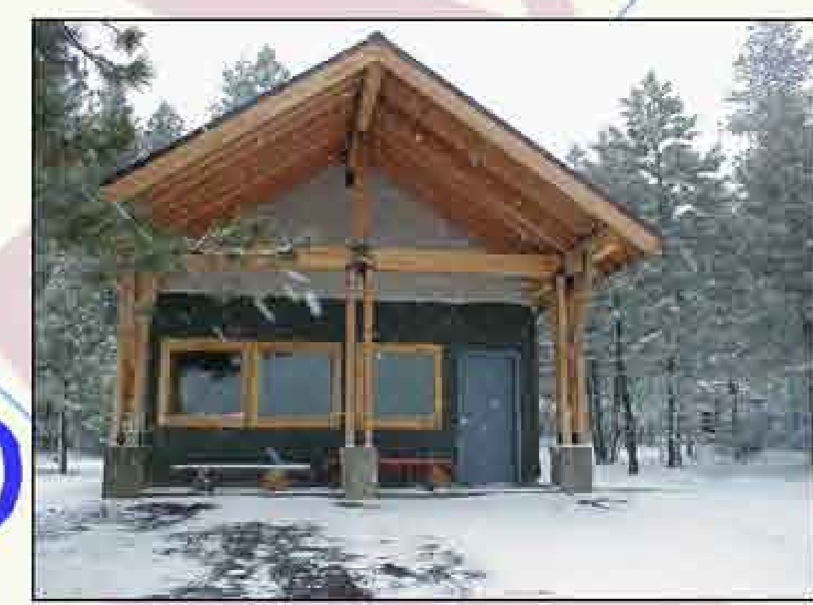
Puffer Butte Warming Hut 4550'

Corral trail is suitable for dogs & snowshoes.